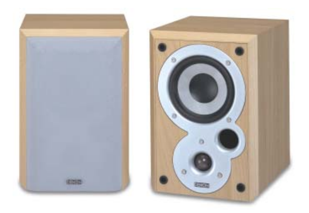
Denon's latest UK designed speaker is the result of many hours of design and research. Once again, extensive listening tests took place with all types of music. Attention to detail and fine-tuning has produced a speaker with a highly sophisticated and amazing depth of sound.